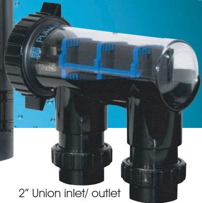
2" Union inlet/ outlet